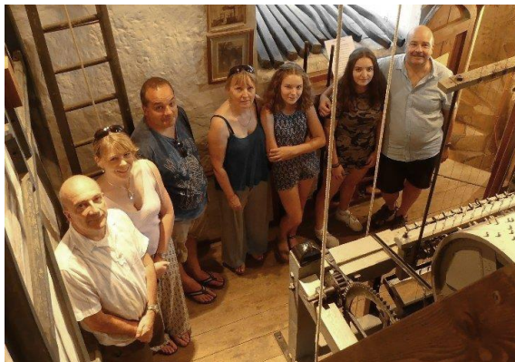
Visiting the clock room