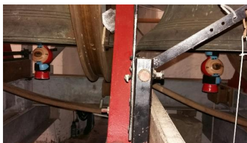
Muffles on treble and 2nd ready to go