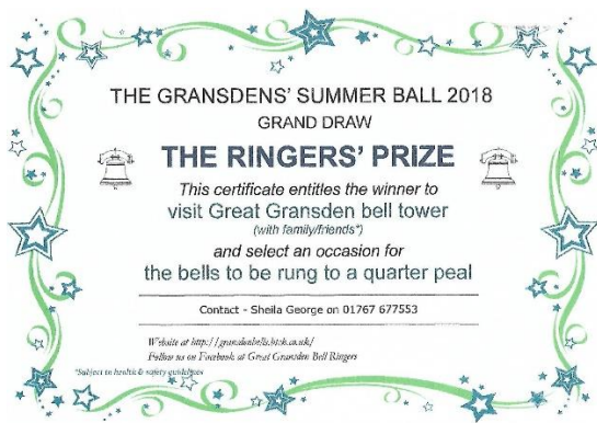
The Ringers' Prize ticket