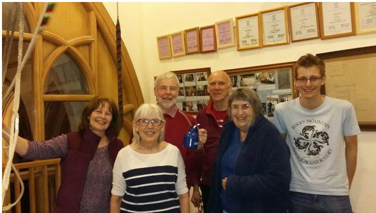
Plain Bob Minor Band.