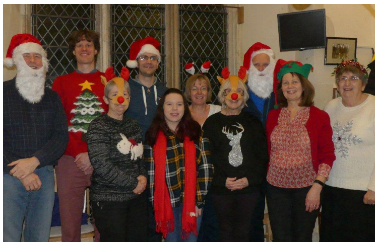
A very Happy Christmas

Best wishes to everyone for 2019, have a very happy Christmas, and thank you to all our readers here and on our Facebook page, and for our ringers' loyal dedication to ringing throughout the year.