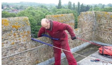
Setting up the ropes at the top of the tower