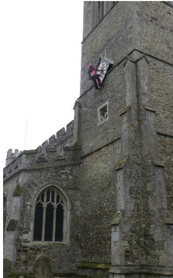
Quite a long way up