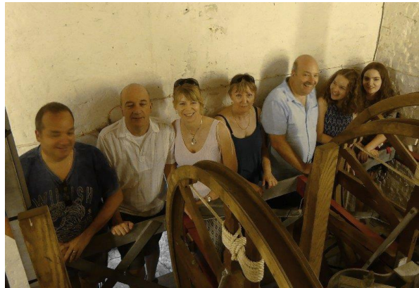
Visiting the belfry