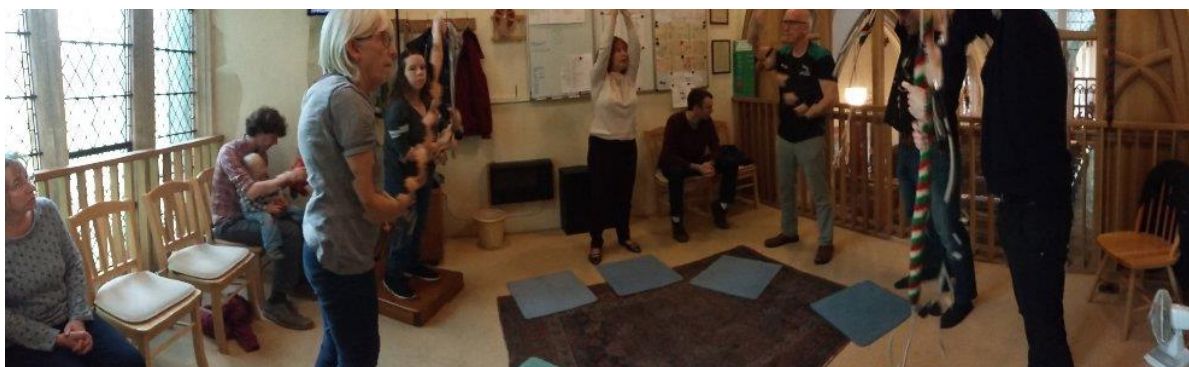
Service ringing on Sunday 30th September 2018