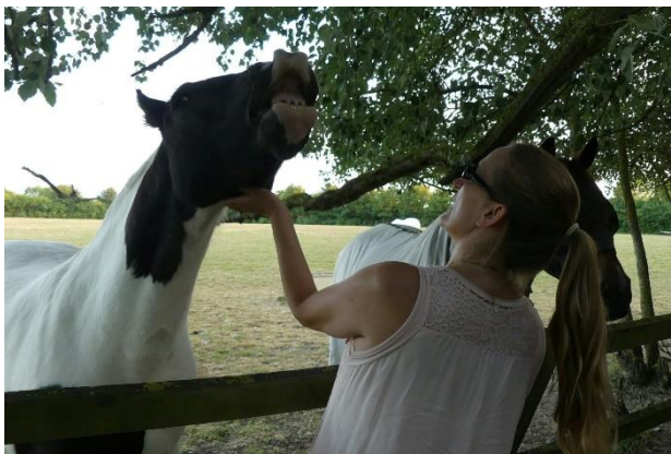
Saying hello to the horses!!