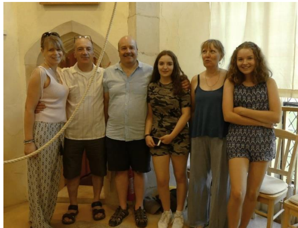
In the ringing room